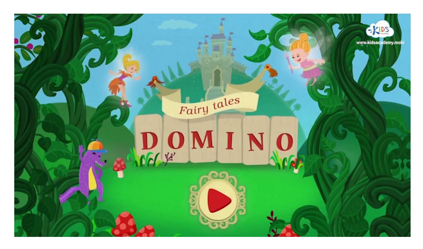
Watch on YouTube