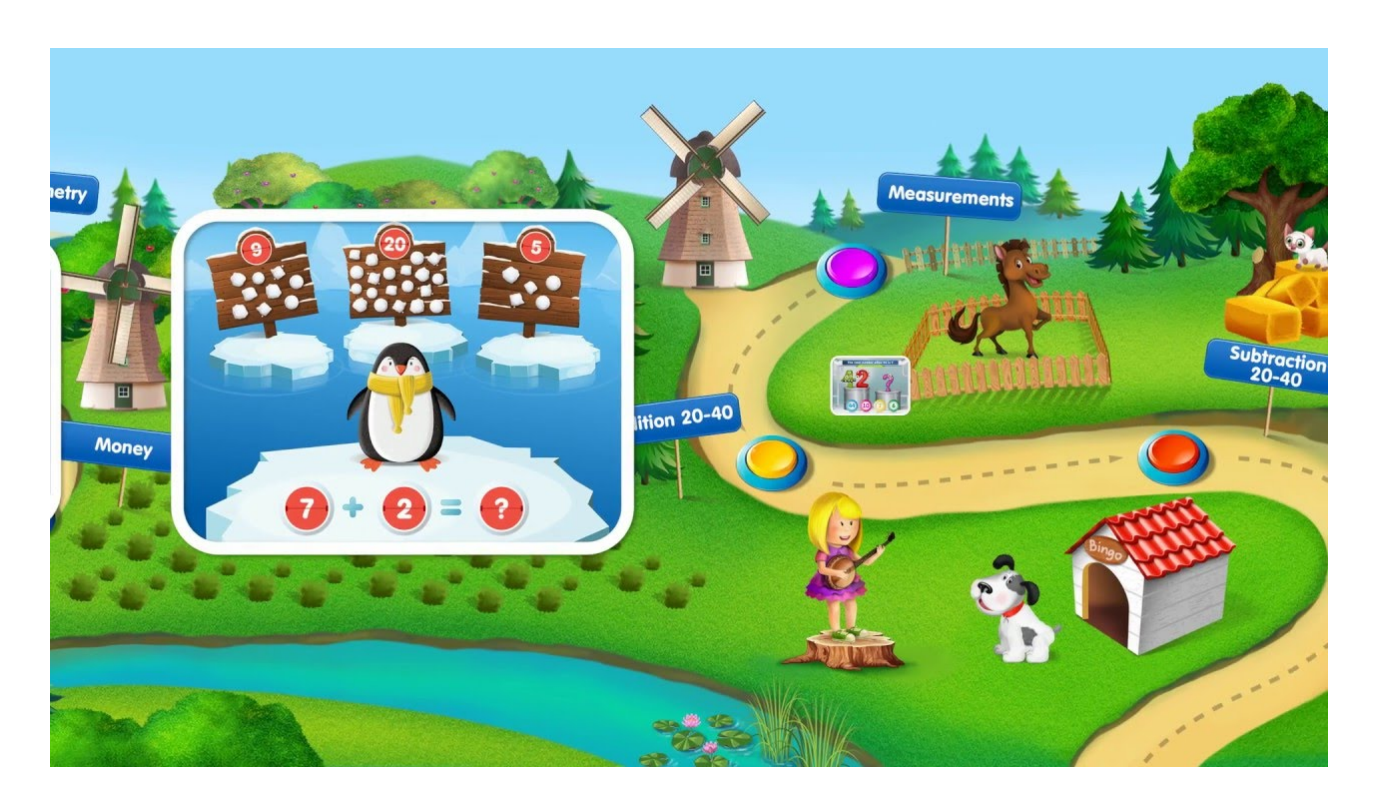
Watch on YouTube