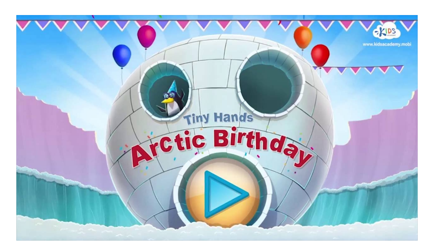
Watch on YouTube

As you know, every child has their own unique educational needs, and gifted kids are no different! Every child needs individualized learning support, no matter their level or label. Discover the possibilities with Kids Academy and find the right apps for your child's needs today!