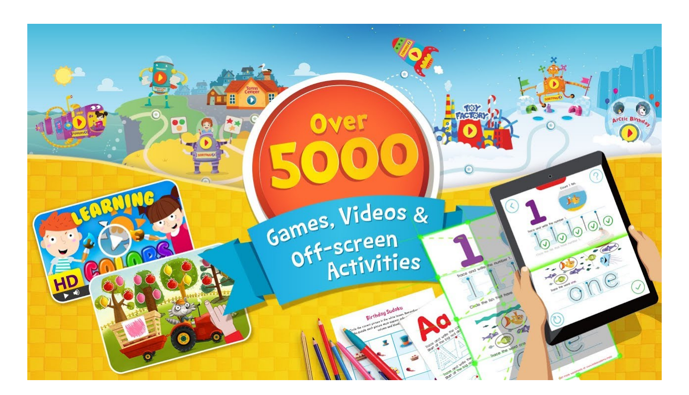
Watch on YouTube