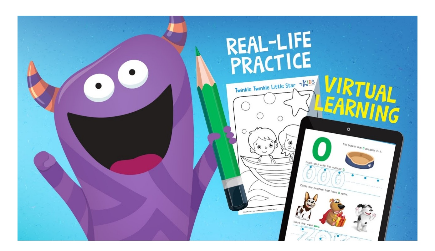
Watch on YouTube