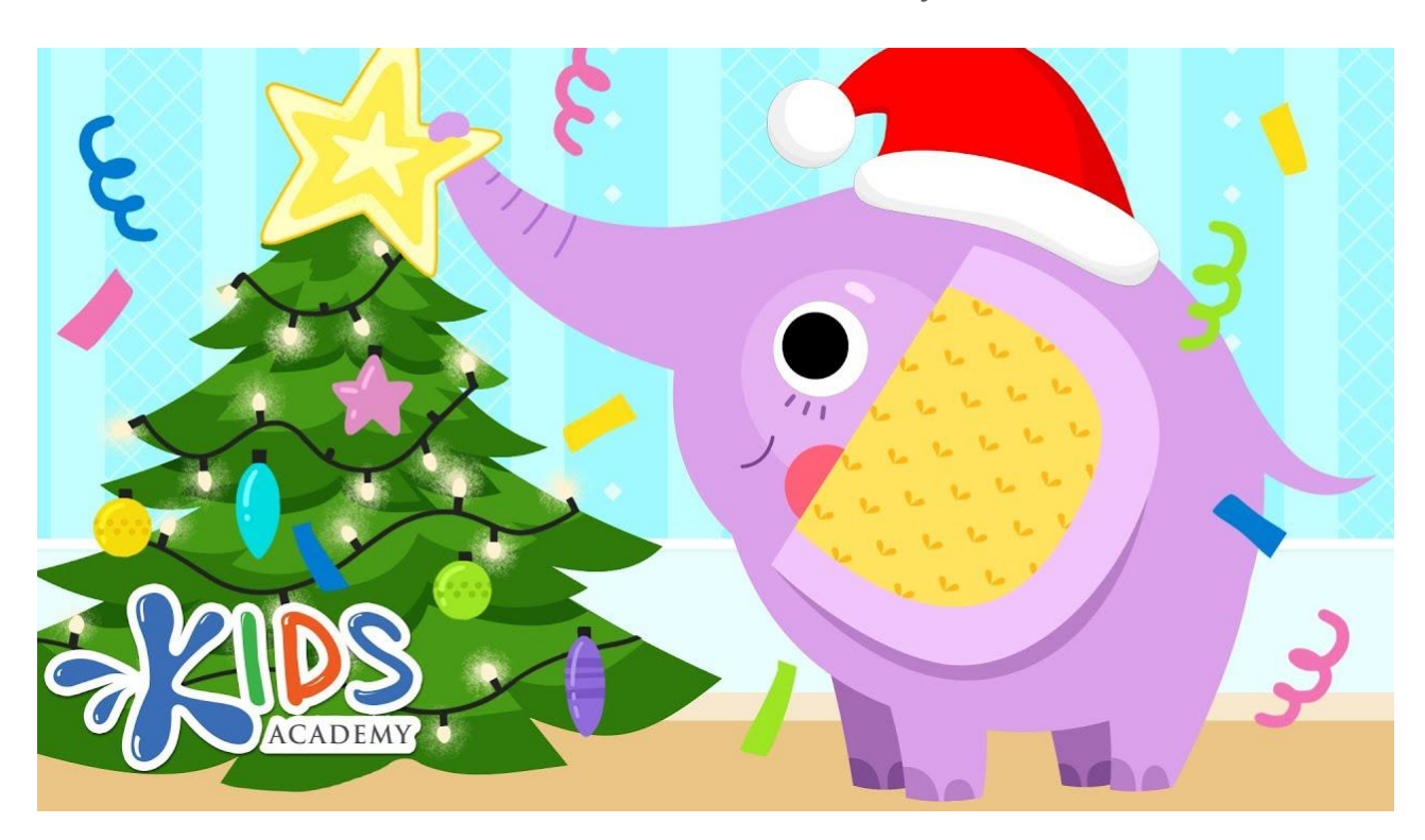
Watch on YouTube

* Check out this fascinating Christmas song to fill your kids with the true holiday spirit and teach them the values celebrated at this time of the year!