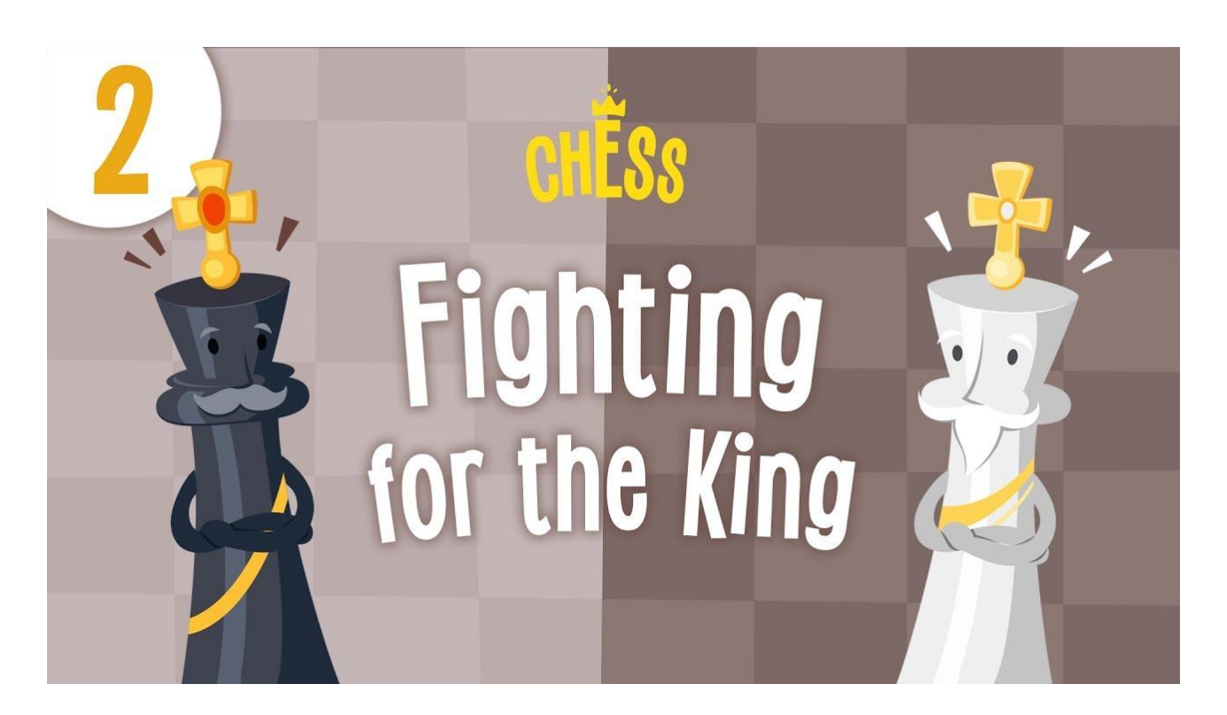
Watch on YouTube

Step 5: Keep up with the latest news, events, and happenings in chess