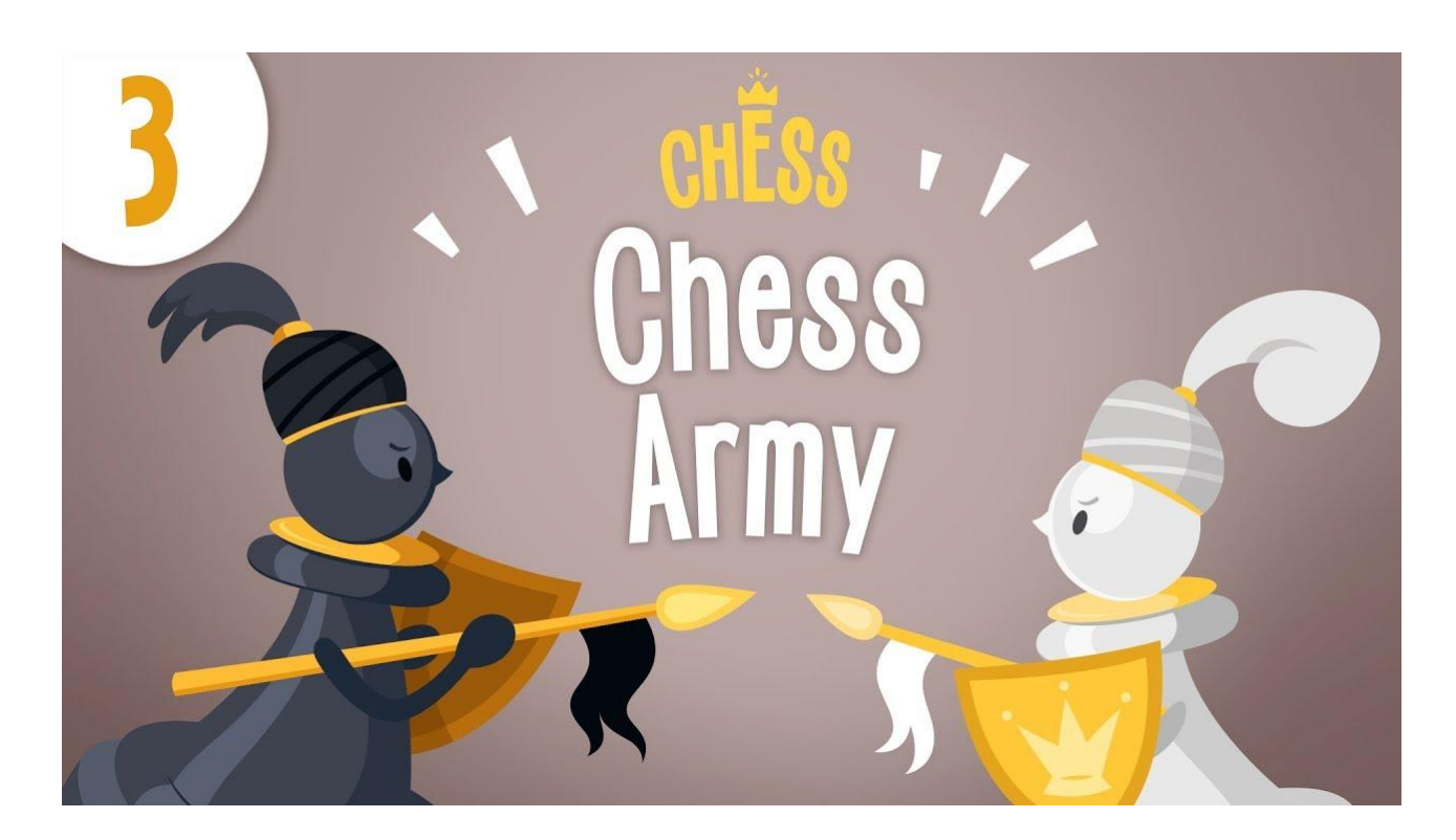
Watch on YouTube