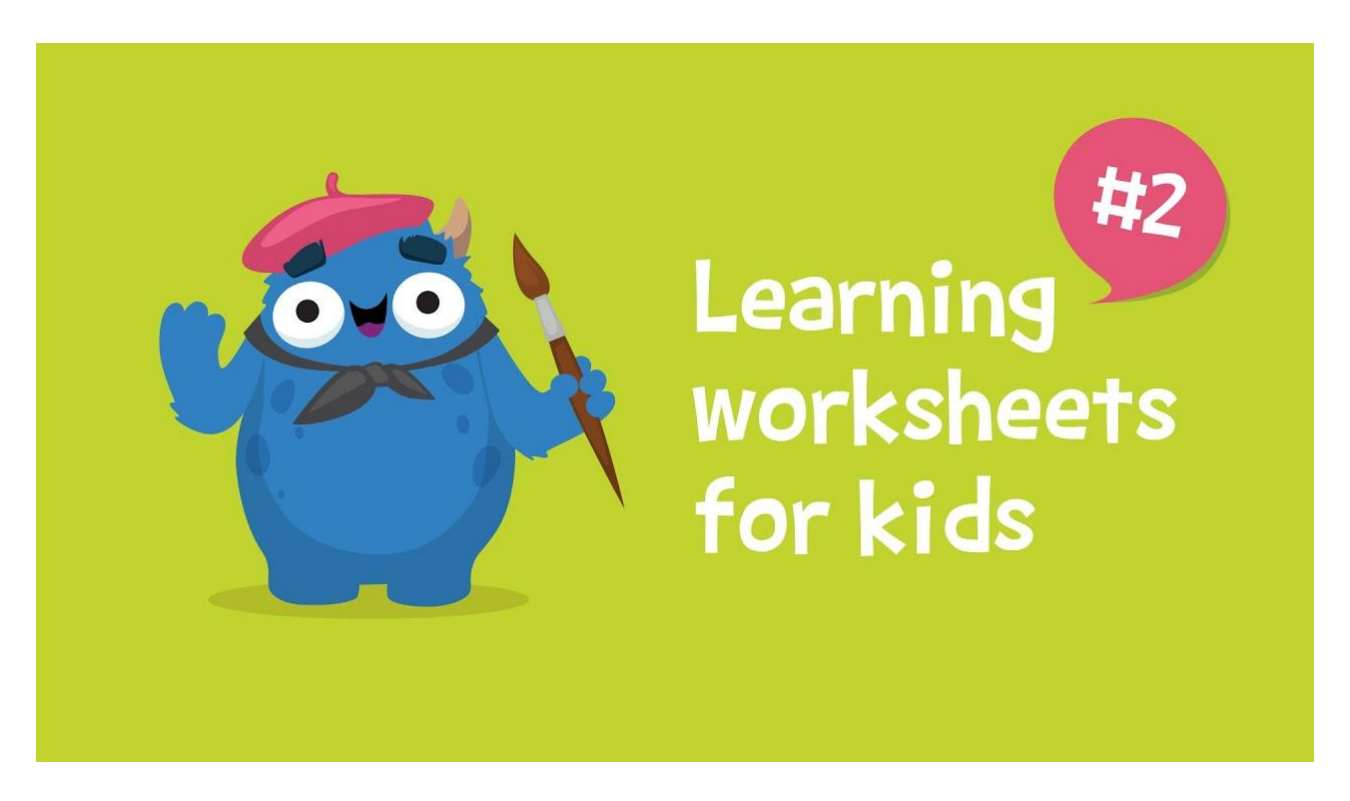
Watch on YouTube

In math, kids often struggle learning about fractions because it's a concept that must be presented visually to children who are concrete thinkers and are unable to understand the concept of anything less than whole numbers. Kids Academy has a fix for that!