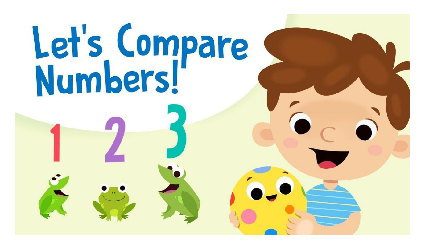
Watch on YouTube

If your kid is a picture person from their early childhood, then be ready to be locked in our fun and educational videos for different topics! You may show them interactive videos with real-life teachers explaining different concepts in Math or Social Studies in simple words, or you may prefer showing them animated cartoon-like videos with Bally and friends: