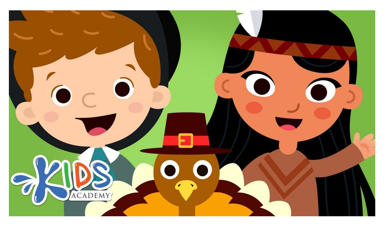
Watch on YouTube

Thanksgiving festivities. Use this animation as a starting point for a discussion about the history of the holiday from the perspectives of both settlers and Indigenous Americans.