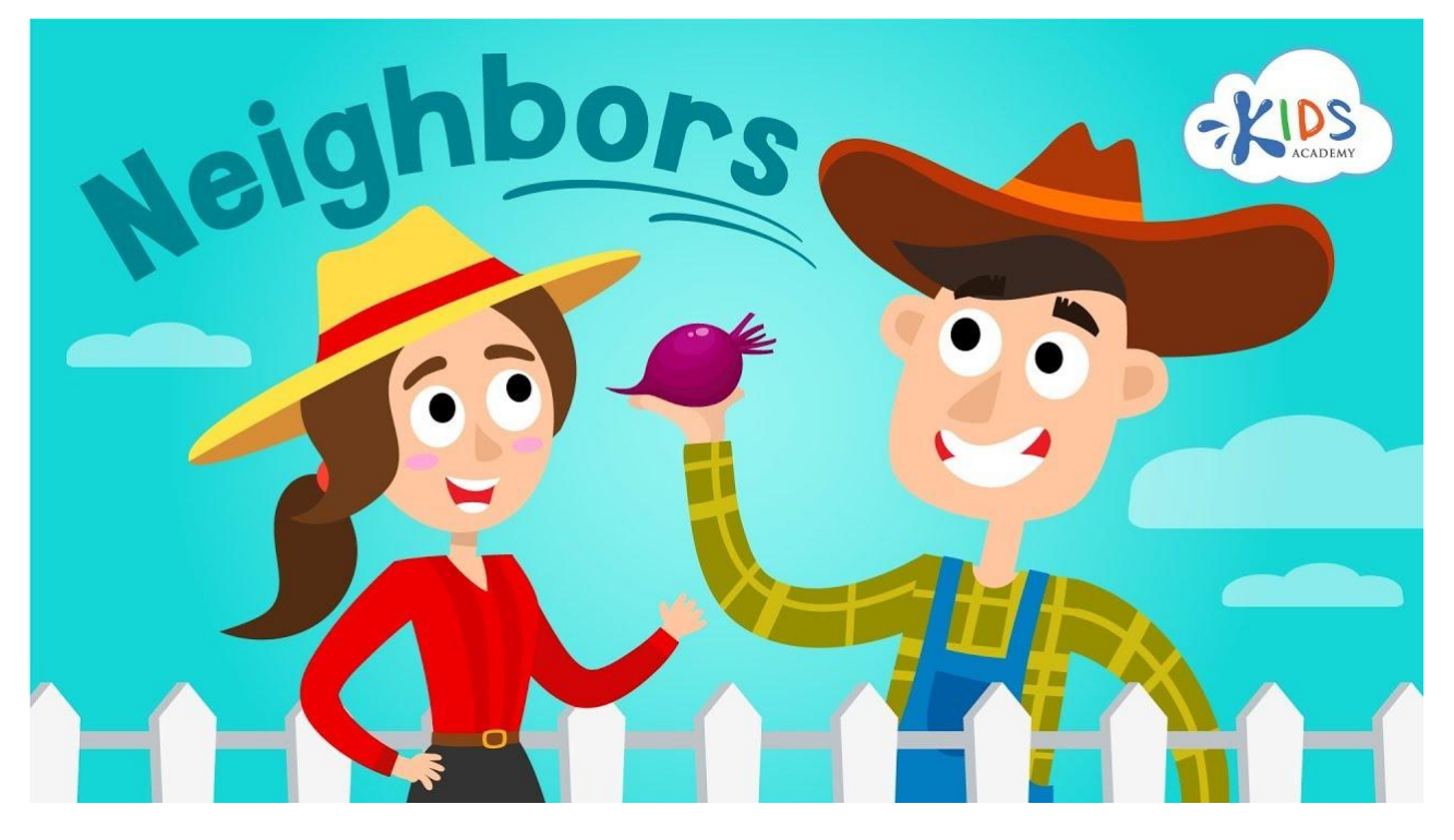
Watch on YouTube

It's time to take a field trip to discover the importance of social studies! Whether through school or by taking a trip around your own community, your child will be excited to learn about their community through first-hand visits or events! Most neighborhoods host local events or classes that help kids learn about safety, such as calling 9-1-1 or about EMT services. Many times fire stations invite kids to tour fire trucks and learn about the equipment and profession. Schools often invite the sheriff to give a talk to students, and some kids are even lucky enough to meet K-9 officers. Check out the events in your area and take your child to learn about local leaders and their important role in the community!